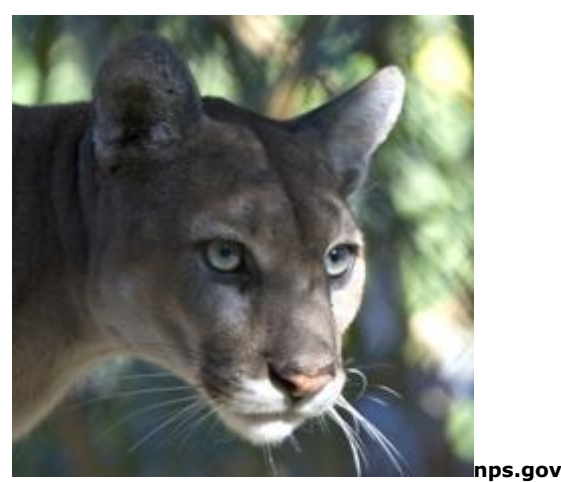
A Florida panther

Unlike most other national parks, Everglades National Park was created to protect an ecosystem from damage. The Everglades is home to about fifteen species that federal officials say are threatened and endangered. They include the Florida panther, the American crocodile and the West Indian manatee.