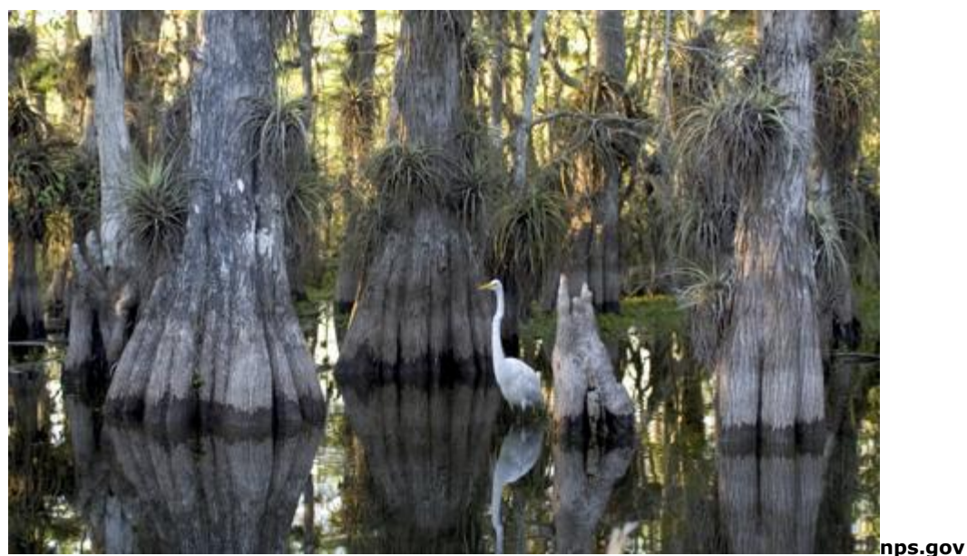
A great egret at Everglades National Park in Florida